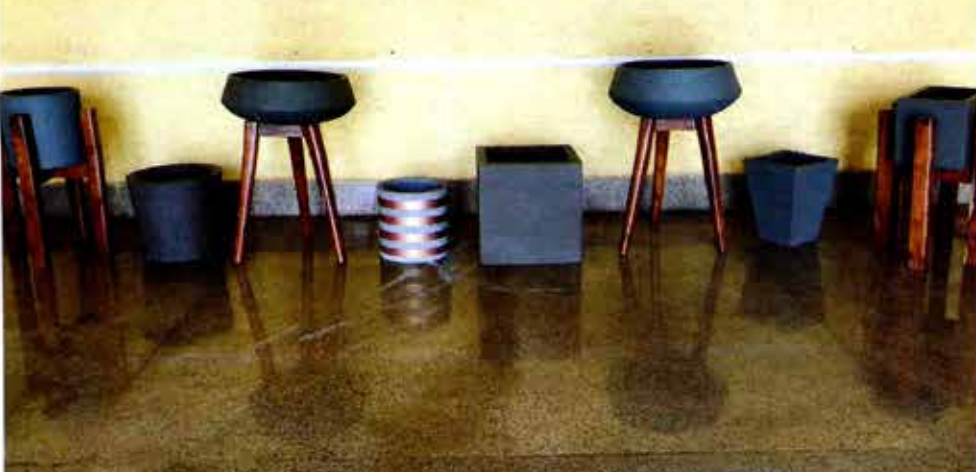
They aspire to cater to the domestic market through their flagship stores in all the metro cities and take the idea of 'Make in India' forward by exporting worldwide.

The products are designed keeping in mind that every piece is multi-dimensional, expressive and a gift to give your own self.