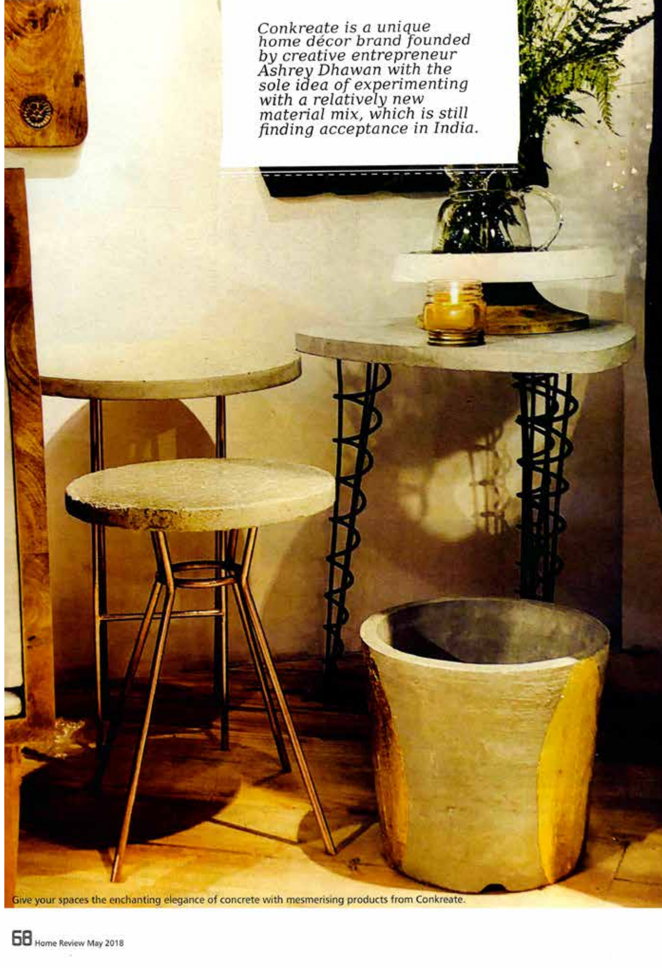
Give your spaces the enchanting elegance of concrete with mesmerising products from Conkreate.